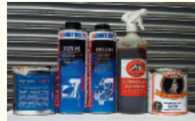
"Outside" products tested

I won't comment on the results because the photos speak for themselves. Here they are: