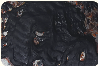
Bilt Hamber Dynax