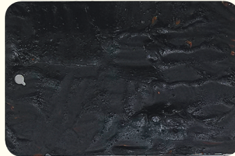
Before 'n' After improved Waxoyl