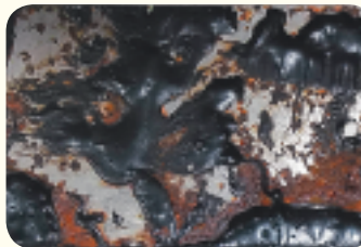
Dinitrol 4941 Car