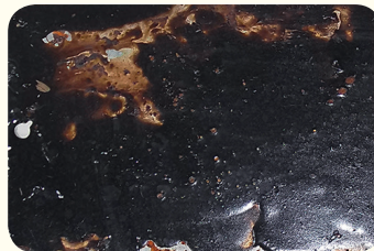
Dinitrol 3125 HS